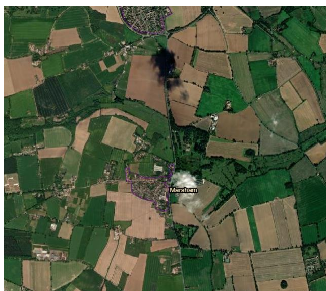
Figure 2: Aerial photos 1