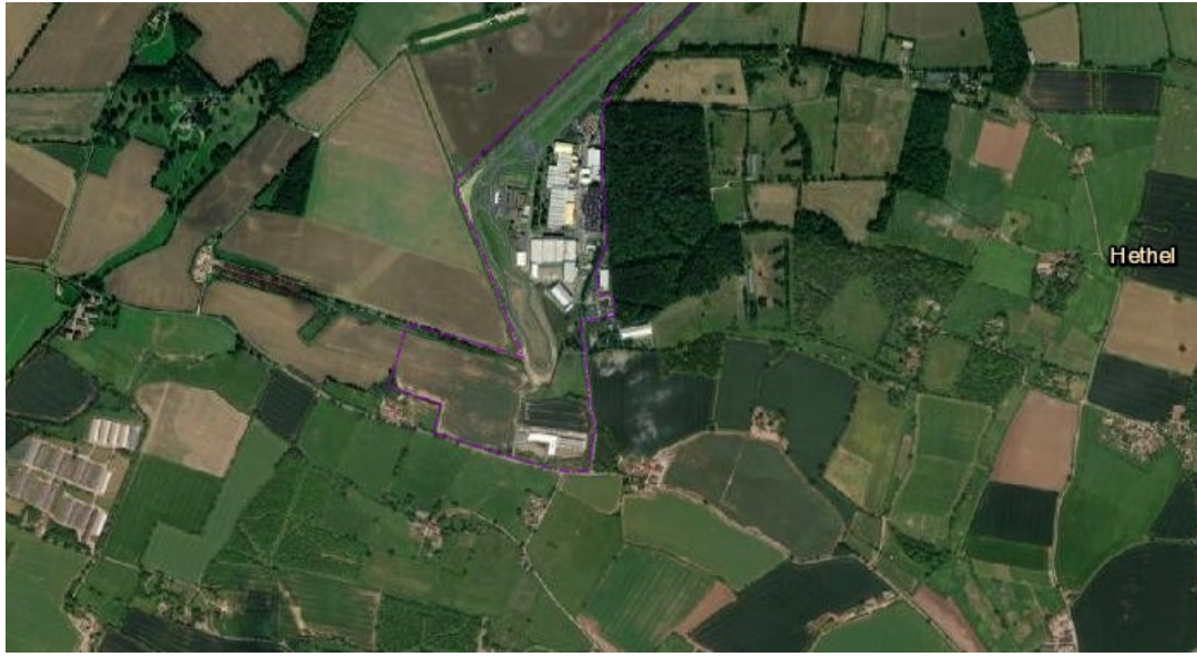
Figure 2: Aerial photos1