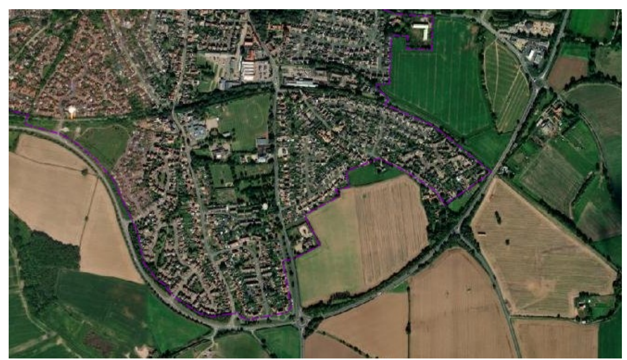
Figure 2: Aerial photos1