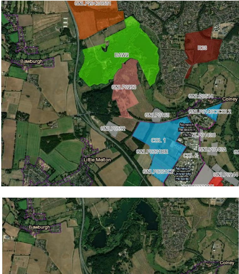
Bawburgh Conser Littis Maiton Littis Maiton

2.1 As shown in figure 1 and 2 the (approximately) 25 hectares site is located in South Norfolk District Council Local Authority area; situated at the west of Norwich Urban Area adjacent to Colney wood and in very close proximity to the Norwich Research Park (NRP) and University of East Anglia (UEA).