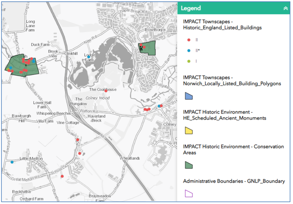
Figure 3 Heritage assets<sup>5</sup>

by elements of Colney Wood, Bawburgh Lakes, Bowthorpe Southern Park Chapel Break Road and part of Bowthorpe / Three Score housing estate.