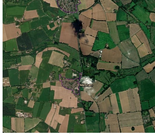
Figure 2: Aerial photos<sup>1</sup>