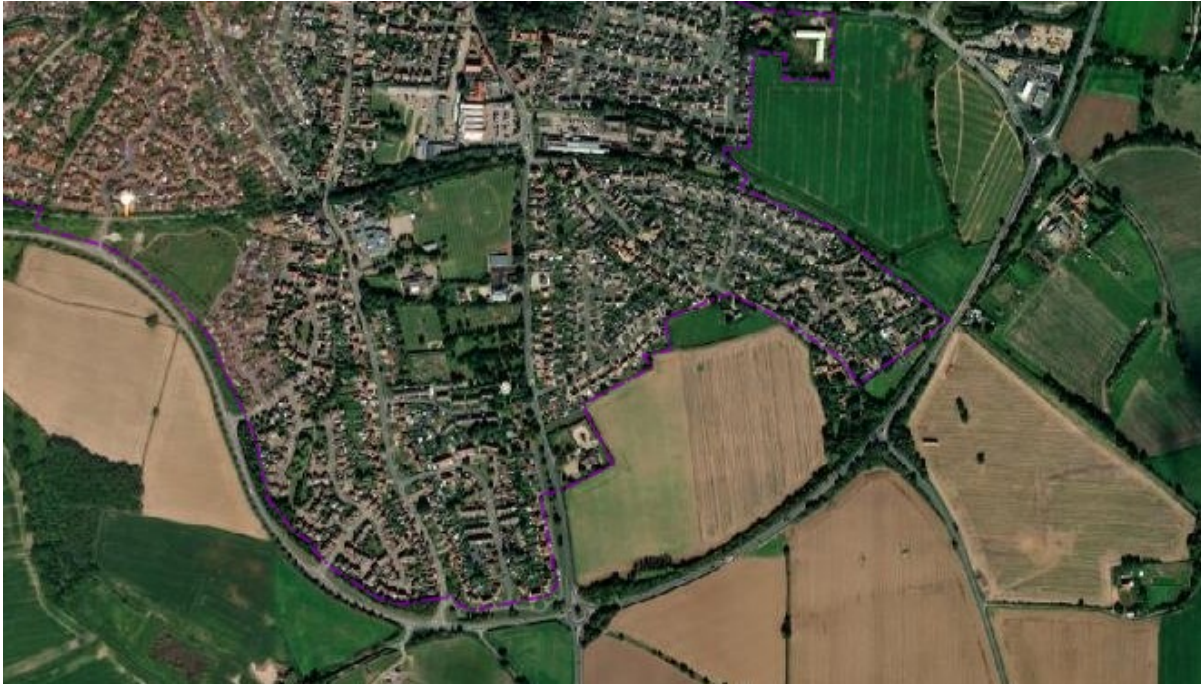
Figure 2: Aerial photos 1

2.2 GNLP0596R is bounded on three sides by residential development at the edge of the town, and on the southern side by the A140 bypass, which separates it from the wider countryside beyond. Along the northern boundary is the rear gardens of properties on Copeman Road. Other boundaries adjacent to Buxton Road and Norwich Road are slightly more open and give glimpses into the site. On the southern boundary, adjacent to the A140, there is more landscaping which screens views into the site.