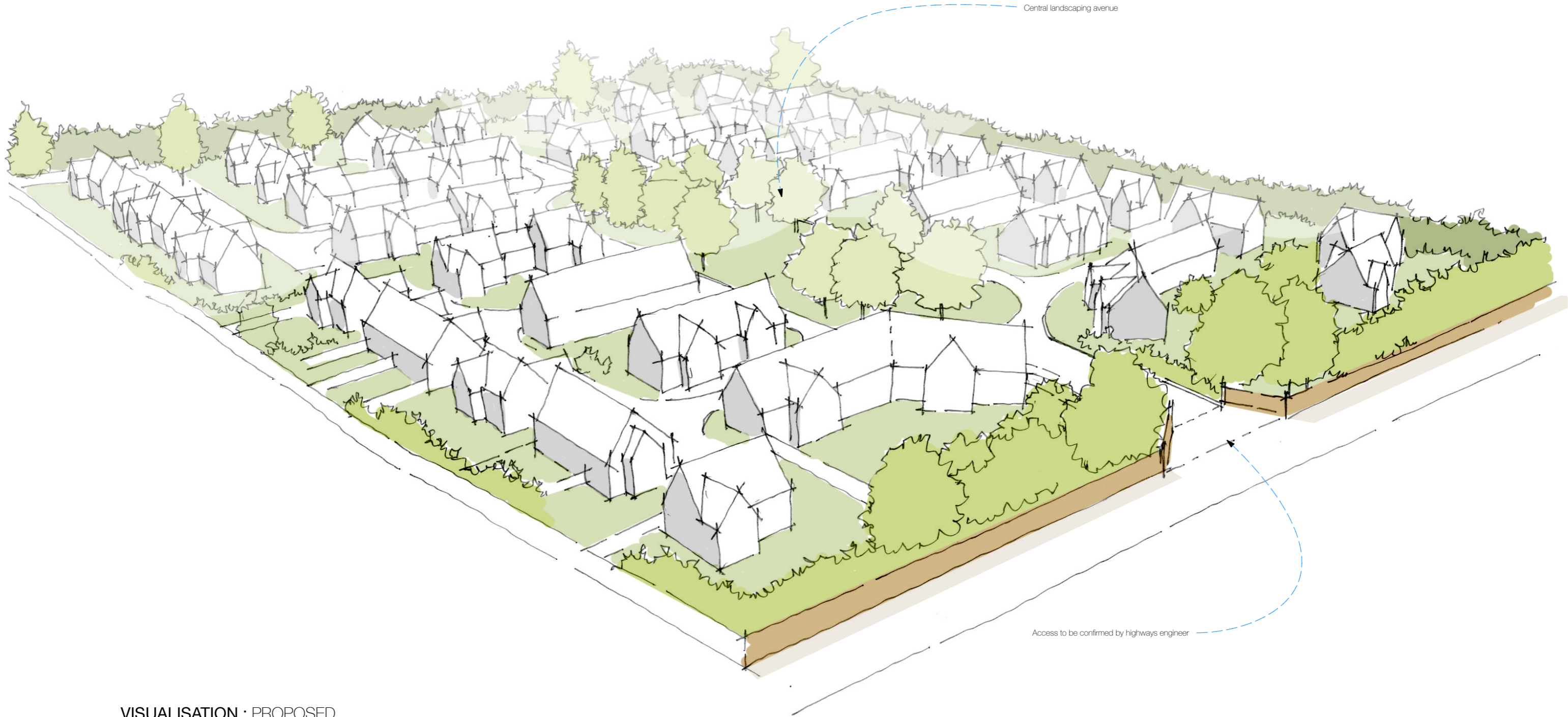
VISUALISATION ; PROPOSED Indicative hand drawing showing proposed site design