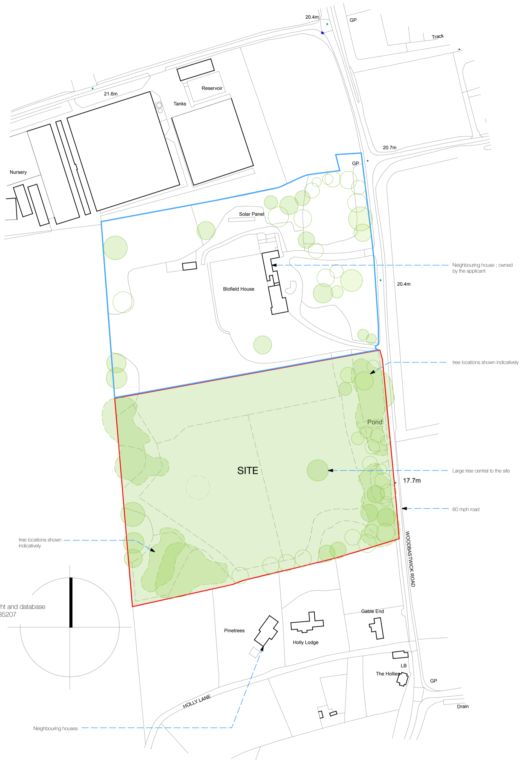
SITE PLAN ; EXISTING Scale 1/2000