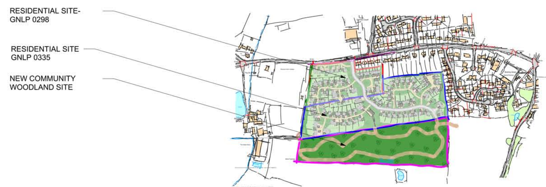
New Community Woodland Scale: 1:5000