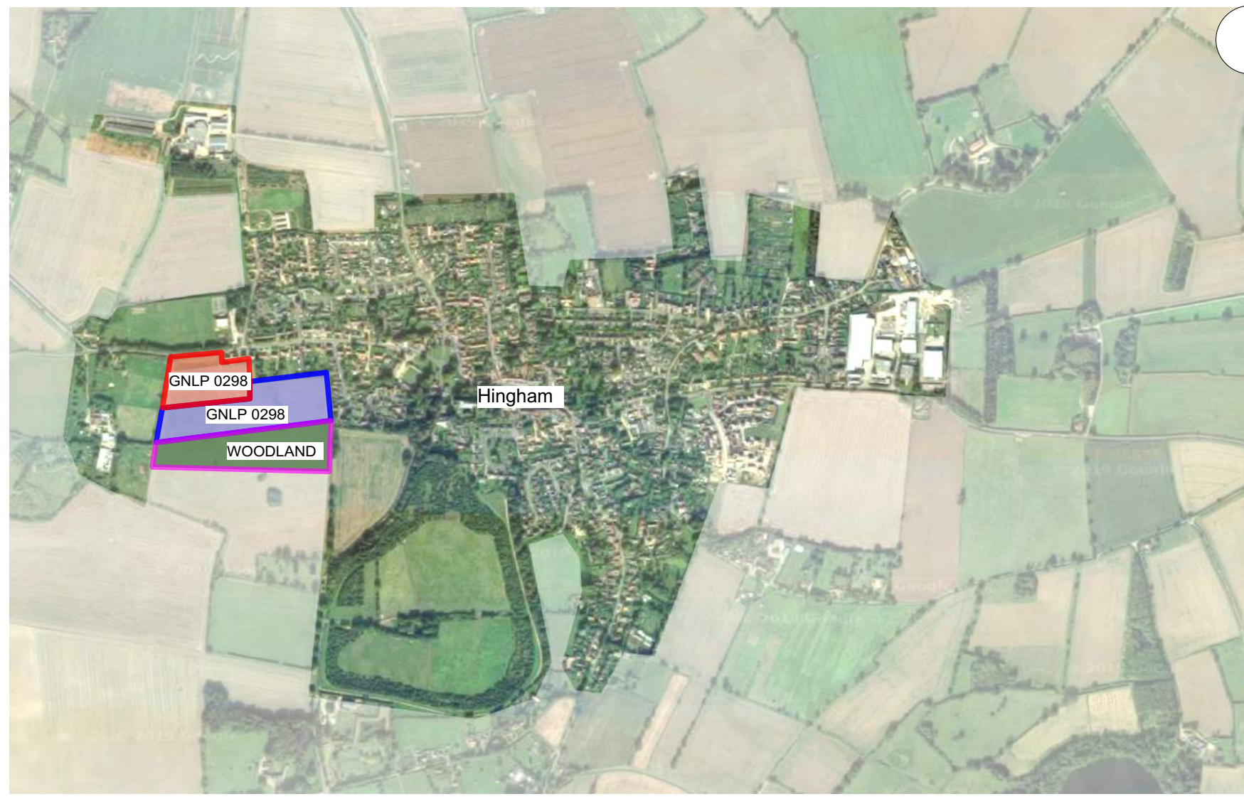
Hingham Aerial View