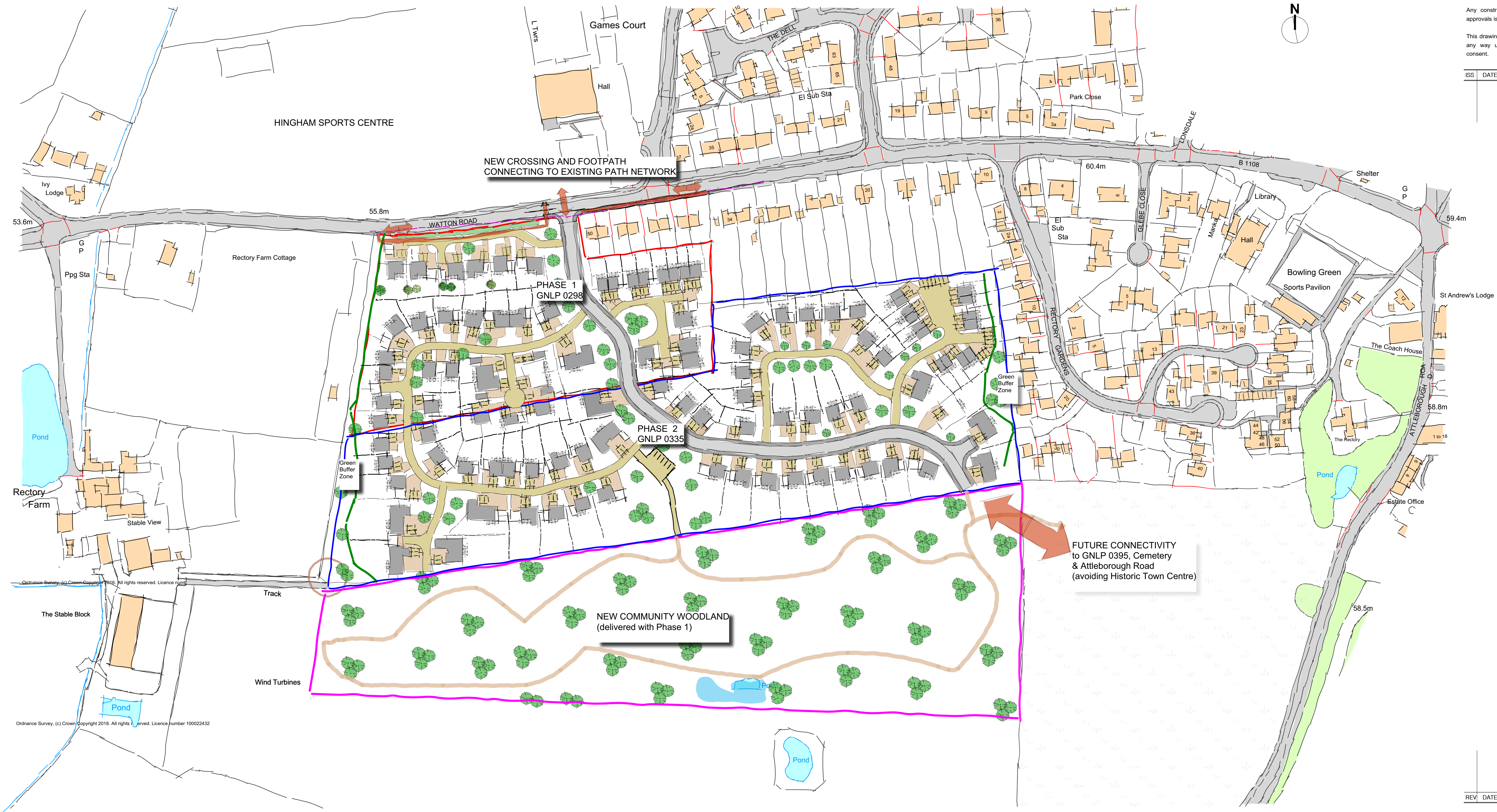
Proposed Indicative Master Plan Scale: 1:1250