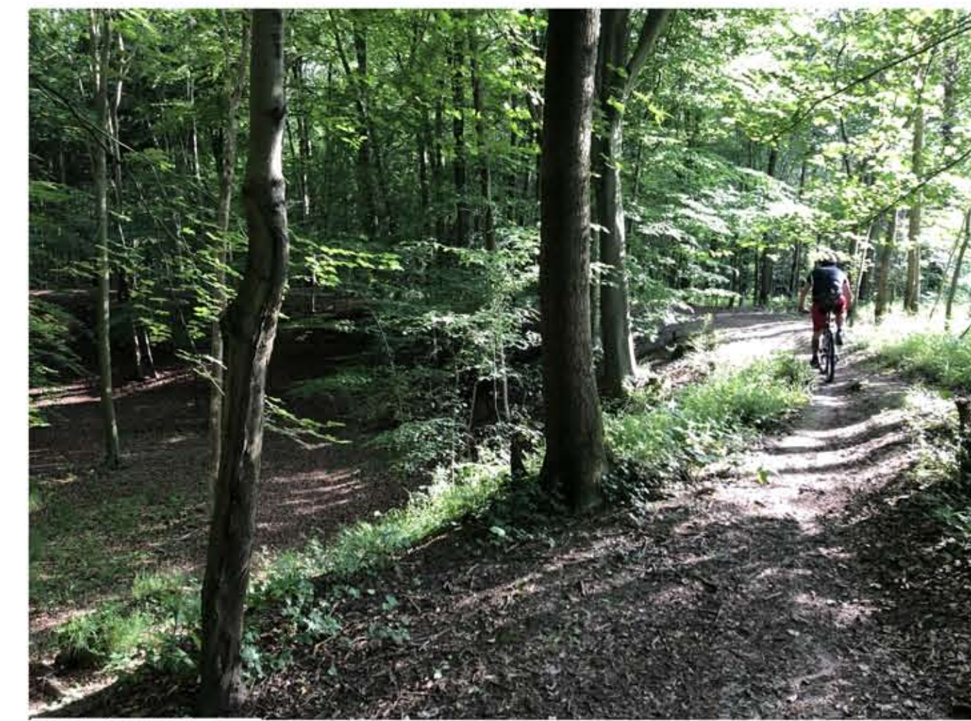
Concept for New Woodland