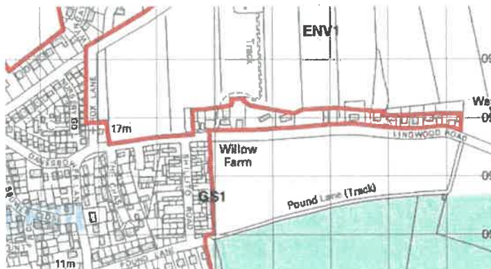
THE SITE BLOFIELD DEVELOPMENT BOUNDARY